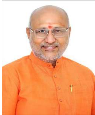
Shri C. P. Radhakrishnan Hon'ble Vice-President of India and Chancellor, Panjab University, Chandigarh